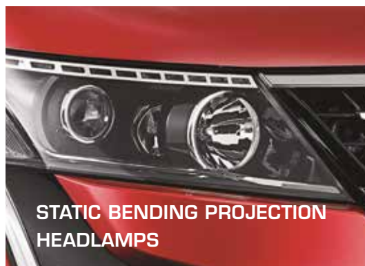
STATIC BENDING PROJECTION HEADLAMPS