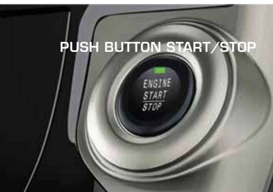
PUSH BUTTON START/STOP