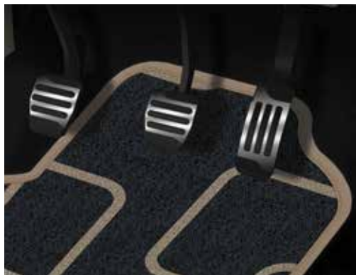
NEW SPORTY ALUMINIUM PEDALS