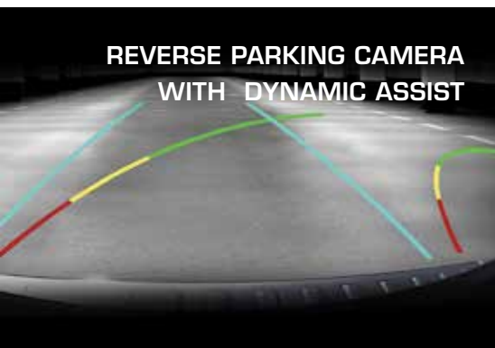
REVERSE PARKING CAMERA WITH DYNAMIC ASSIST