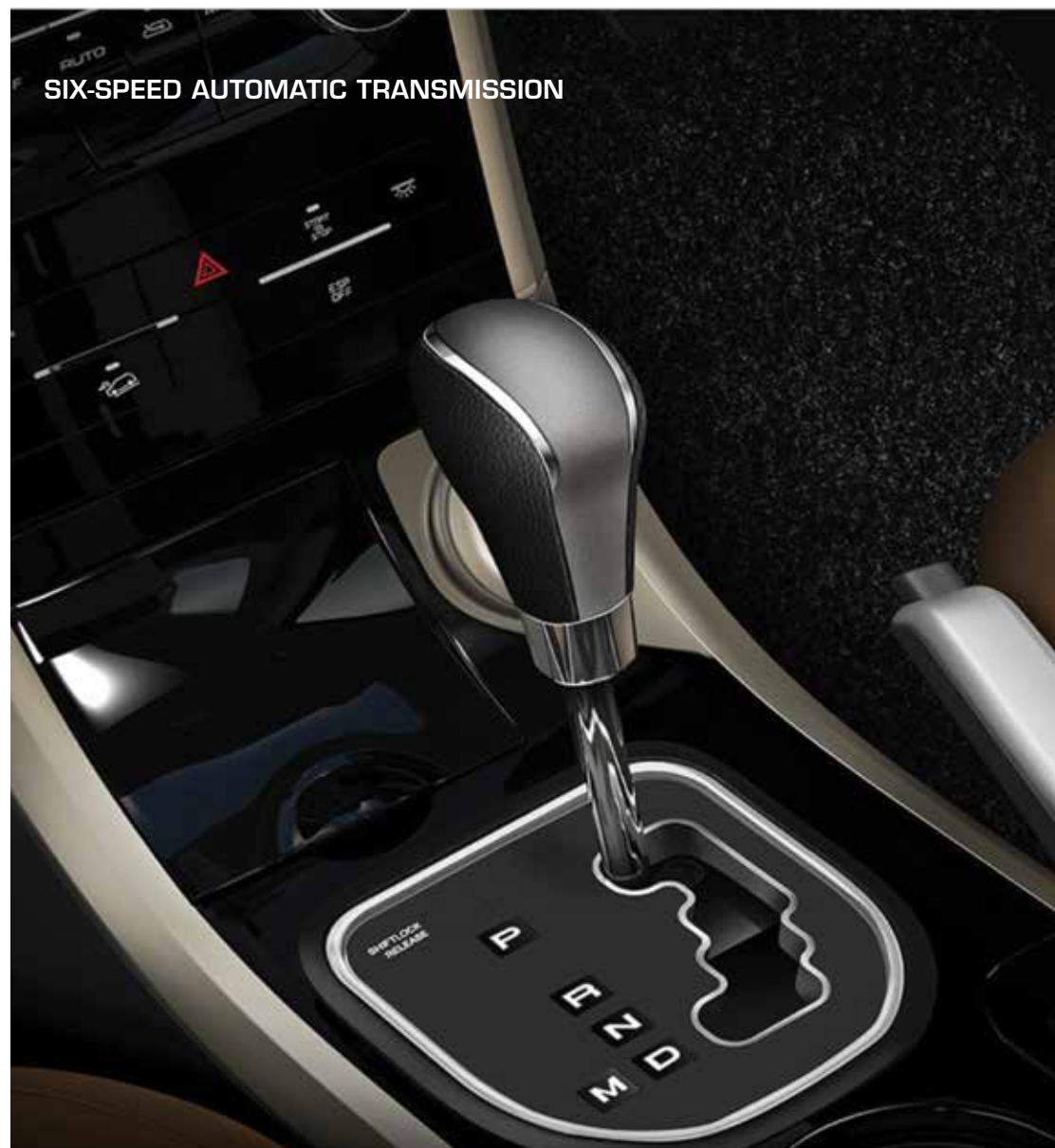
SIX-SPEED AUTOMATIC TRANSMISSION