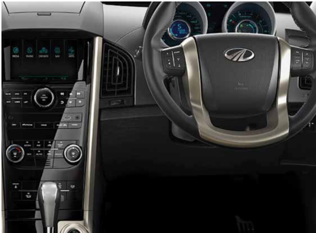
TELESCOPIC STEERING WHEEL WITH TILT TO ENSURE YOUR PERFECT DRIVING COMFORT