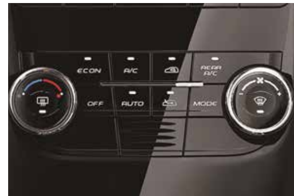
FULLY AUTOMATIC TEMPERATURE CONTROL

Please note: Specifications, detailing and finishes differ on the various models available - please consult the specification sheet at the back of this brochure or your dealer for more information.