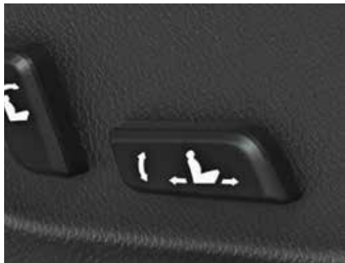
6-WAY POWER ADJUSTABLE DRIVER'S SEAT