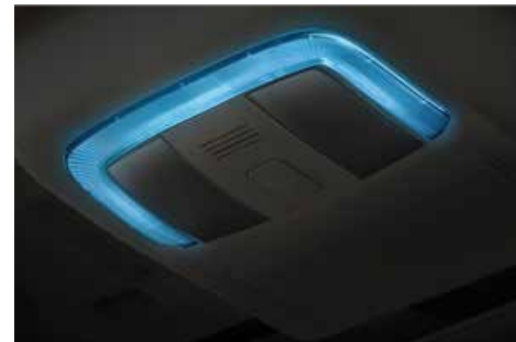
ICY-BLUE MOOD LIGHTING IN THE CABIN