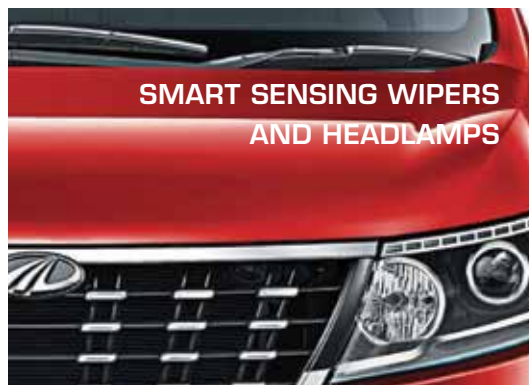
SMART SENSING WIPERS AND HEADLAMPS