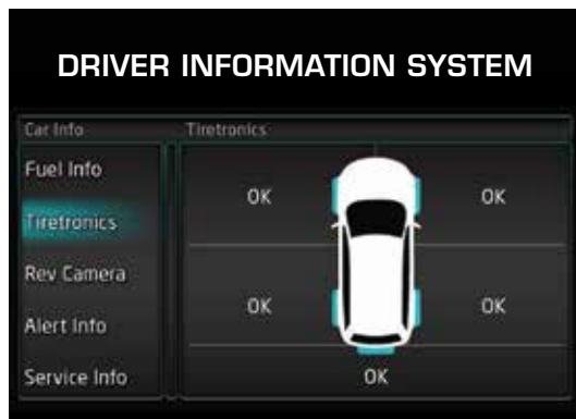
DRIVER INFORMATION SYSTEM